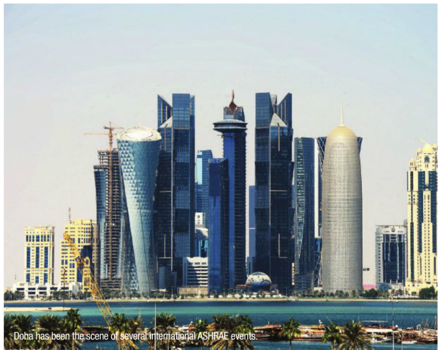
Doha has been the scene of several international ASHRAE events.

“Another issue which makes a difference between here and America or Europe is that, here in the Gulf, everyone comes [to the region] to work and the working hours per day are excessive,” he continues. “Everyone is in the office till eight o’ clock or sometimes